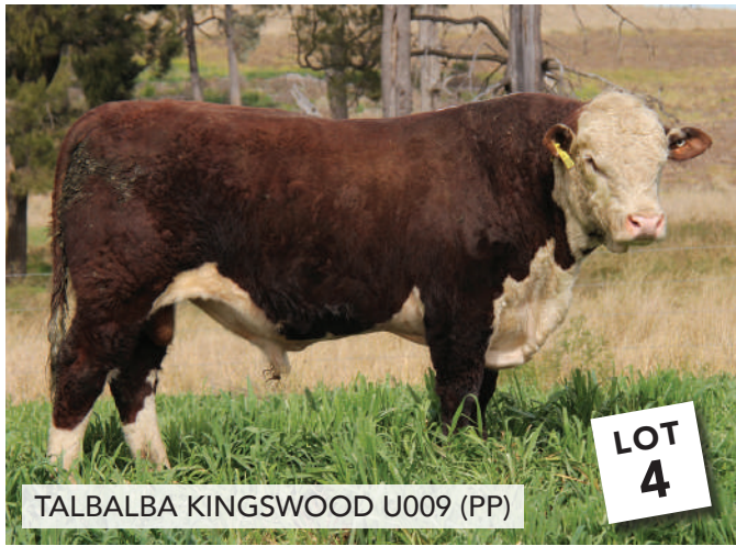
TALBALBA KINGSWOOD U009 (PP)