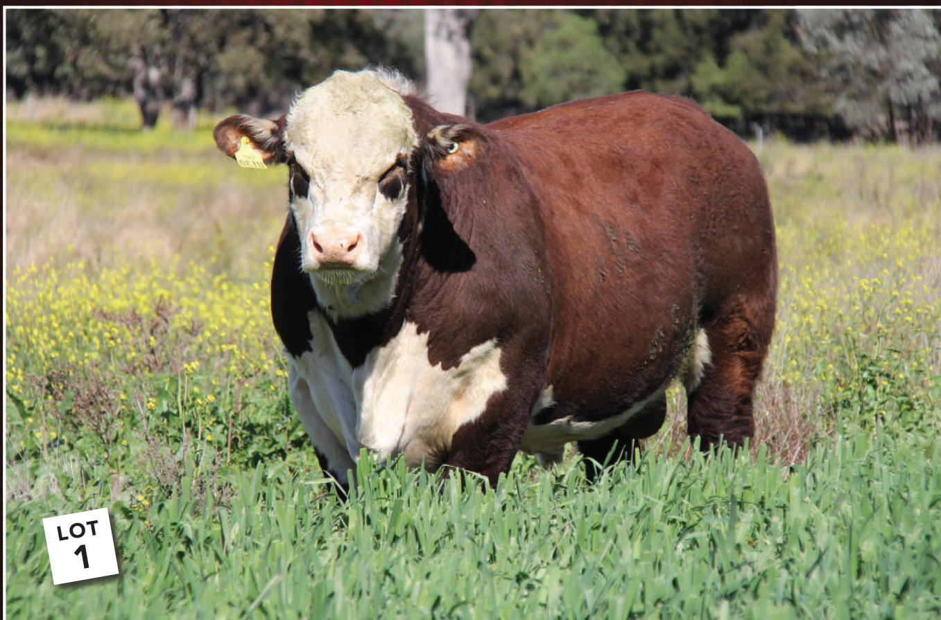
LOT 1 TALBALBA KENROY U130(PP). THREE QUARTER BROTHER TO LAST YEAR'S TOP SELLER PICTURED ABOVE.