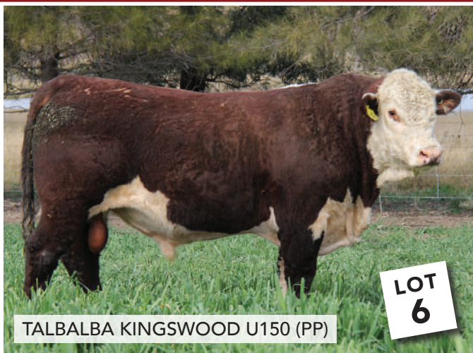
TALBALBA KINGSWOOD U150 (PP)