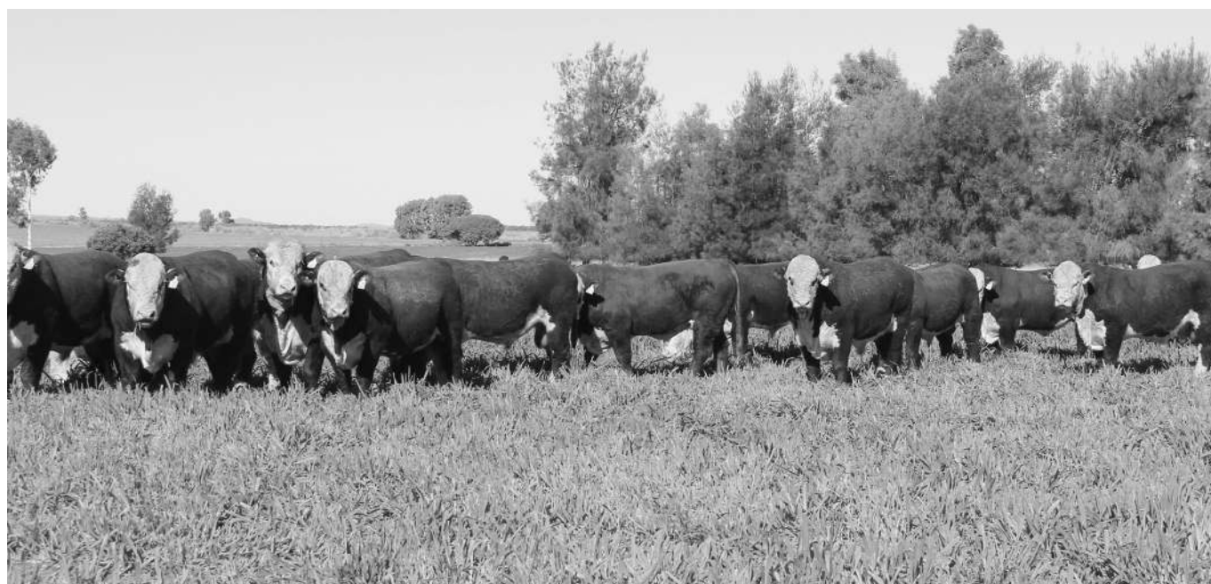
2025 Sale bulls