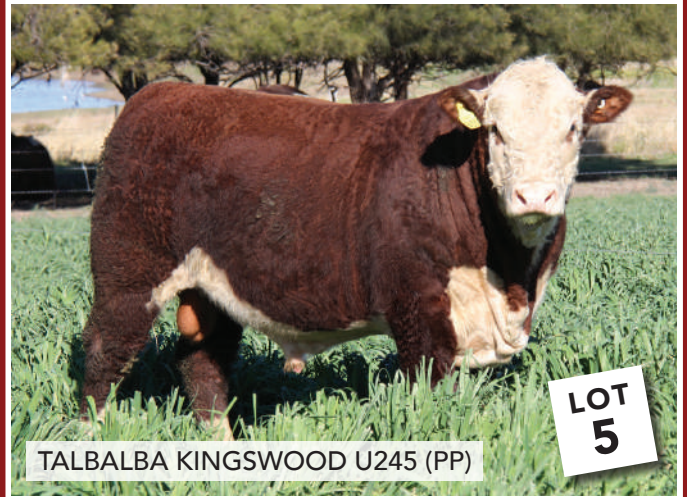
TALBALBA KINGSWOOD U245 (PP)