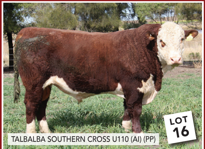
TALBALBA SOUTHERN CROSS U110 (AI) (PP)