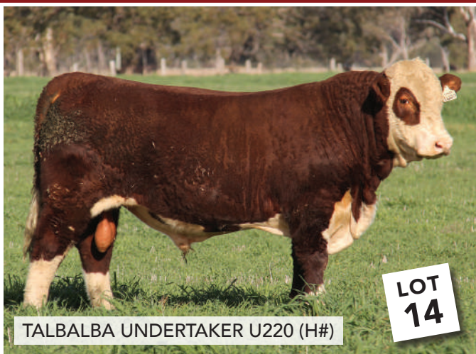
TALBALBA UNDERTAKER U220 (H#)