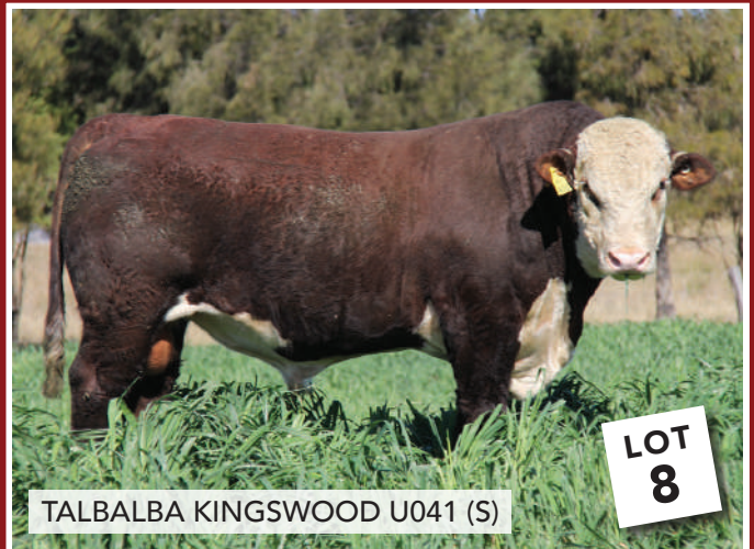
TALBALBA KINGSWOOD U041 (S)