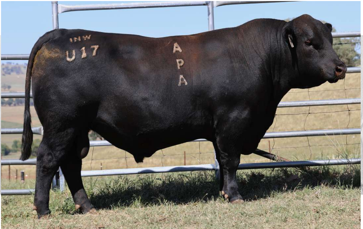
LOT 5 - AYR PARK PACIFIC U17