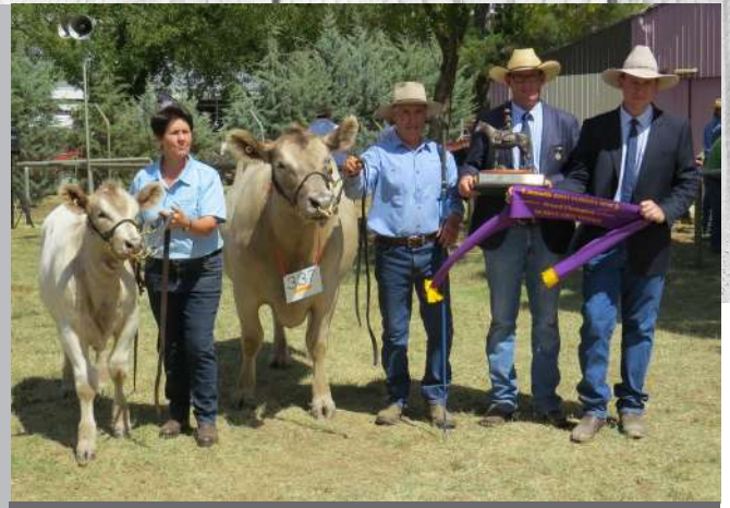
2018 – Ayr park Kristen L72 Senior & Grand Champion Canberra Royal