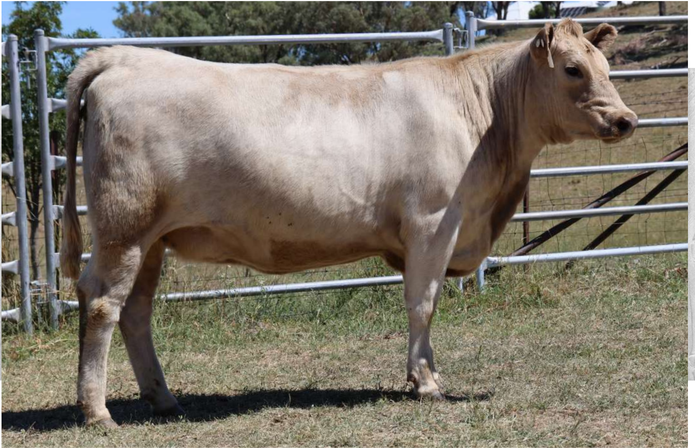
LOT 23 - AYR PARK AMETHYST U45