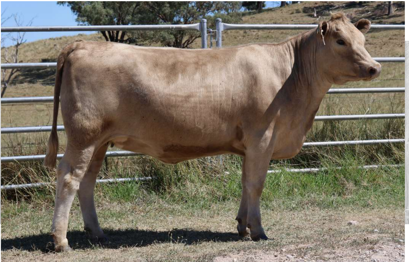
LOT 24 - AYR PARK MATINA U47