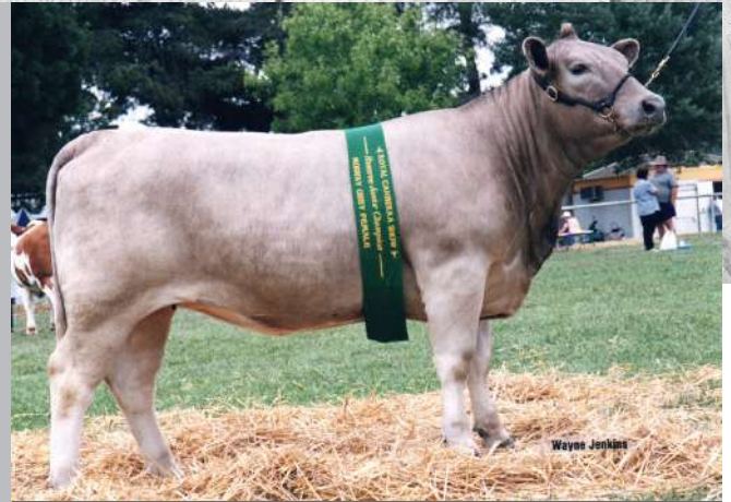
2001 - Ayr Park Cleopatra U31 Reserve Junior Champion Female Canberra Royal