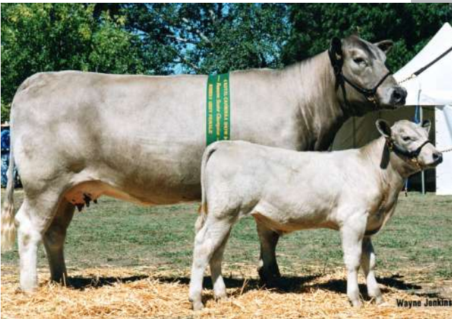
2003 - Ayr park Cleopatra U31 Reserve Senior Champion Female Canberra Royal