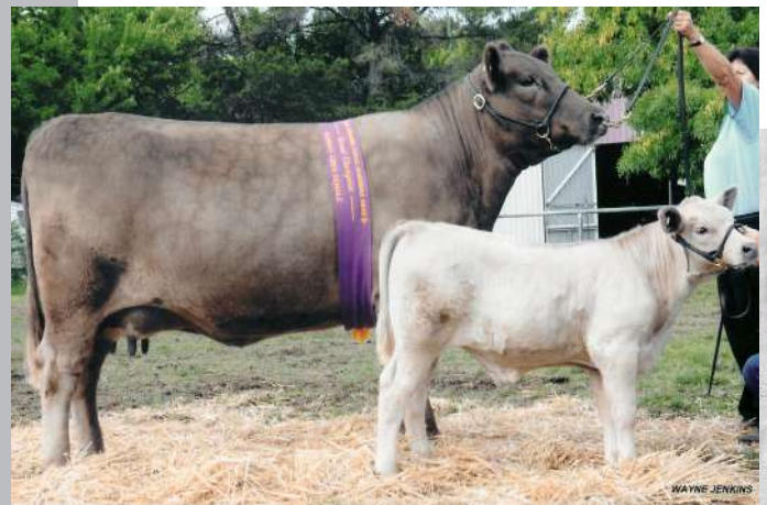
2013 - Ayr Park Roberta F78 Senior & Grand Champion Female Canberra Royal