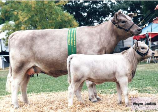
2000 - Ayr Park Roberta S5 Reserve Senior Champion Female Canberra Royal