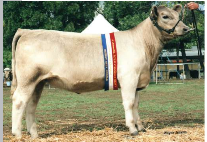
2007 - Ayr Park Jacinta B12 Junior Champion Female Canberra Royal