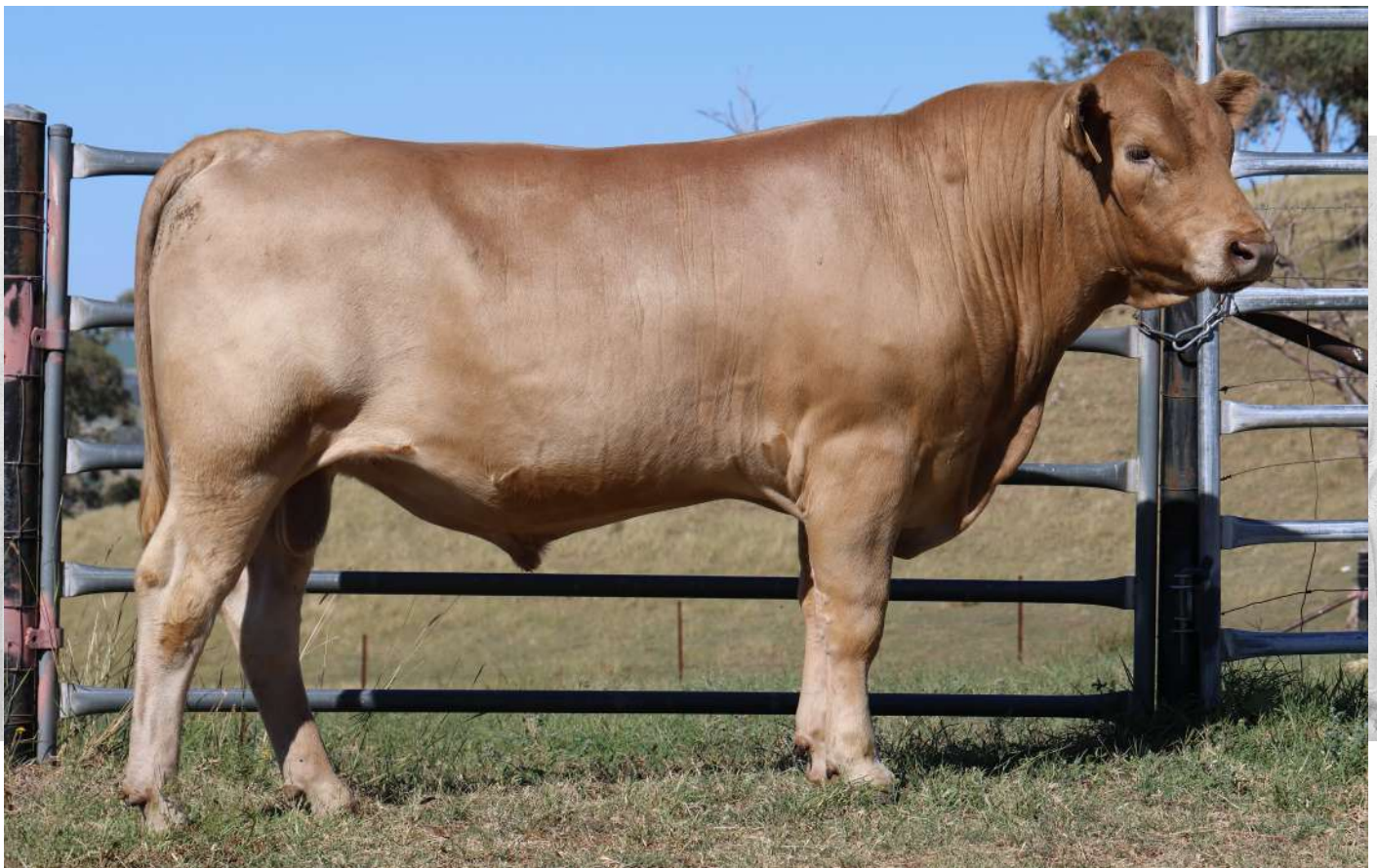
LOT 15 - AYR PARK UTOPIA U57