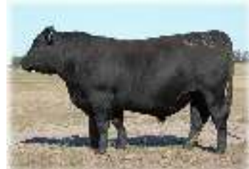
Lot 14 Keringa Never Never N238