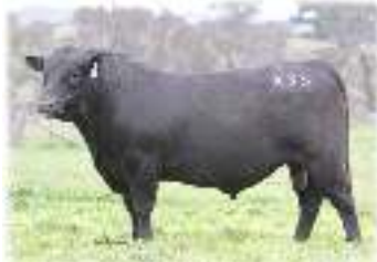
Millah Murrah Kingdom K35 (11 Sons Sell)