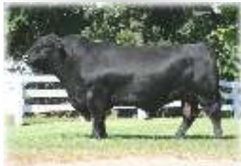
EF Complement (6 Sons Sell)