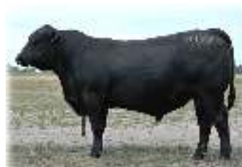
Lot 5 Keringa Nest Egg N197