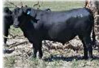
Lot 32 Keringa N93