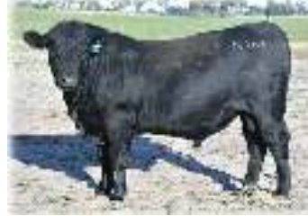
Lot 48 Keringa Nauticle N166