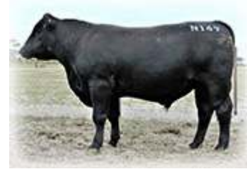
Lot 60 Keringa Nauticle N149