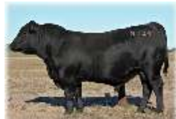
Lot 1 Keringa New Age N124