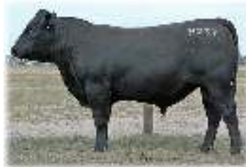
Lot 42 Keringa Next world N237