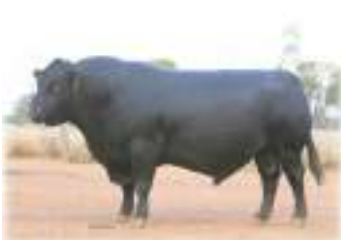
Carabar Docklands D62 (9 Sons Sell)