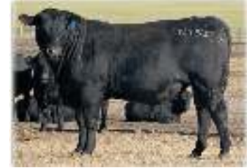
Lot 58 Keringa Nauticle N152