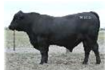
Lot 9 Keringa New Age N115