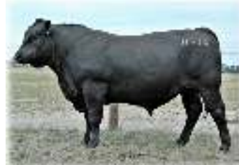
Lot 8 Keringa Next World N173