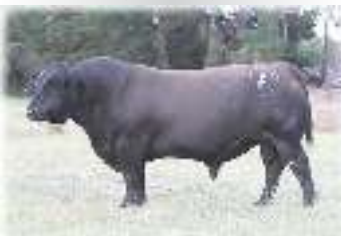
Pathfinder Goldmark D189 (3 Sons Sell)