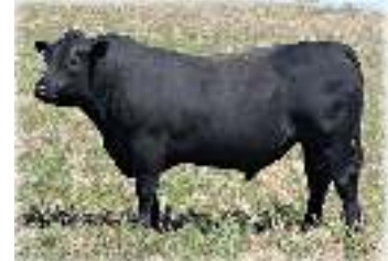
Lot 35 Keringa 41