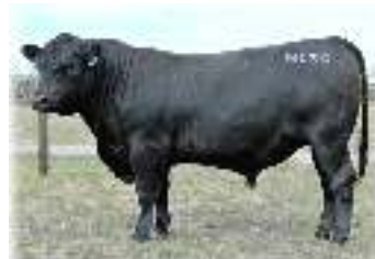
Lot 2 Keringa New Age N134