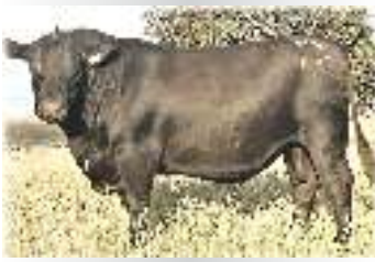
Millah Murrah Highlander F32 (8 Sons Sell)