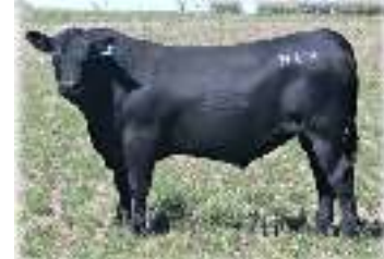
Lot 34 Keringa N88