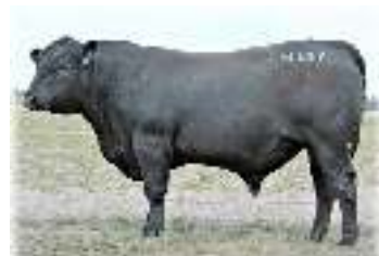
Lot 7 Keringa Nest Egg N117