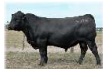
Lot 13 Keringa Nest Egg N170